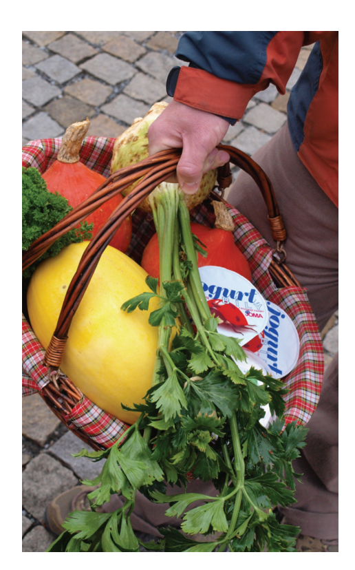
Fresh vegetable and dairy products from local producers bought at the Pilsen farmers' market, Czech Republic

As a strong indicator of transition, many connected institutions (chambers of agriculture and extension services, education, ministries...) had to adapt their framework because of the existence of such initiatives (at the regional or national levels), and to get involved. For example in Pilsen, this type of initiative very rapidly found an echo at the national level: in 2010: In 2011, the Ministry of environment created a grant scheme supporting newly created farmers markets for 6 months. The 10 million CZK mobilised were used to support farmers markets. Due to this support the number of places with the farmers market in the Czech Republic very quickly doubled (from 100 to 200). The Ministry of Agriculture also initiated a discussion aiming to codify the concept of farmers markets.