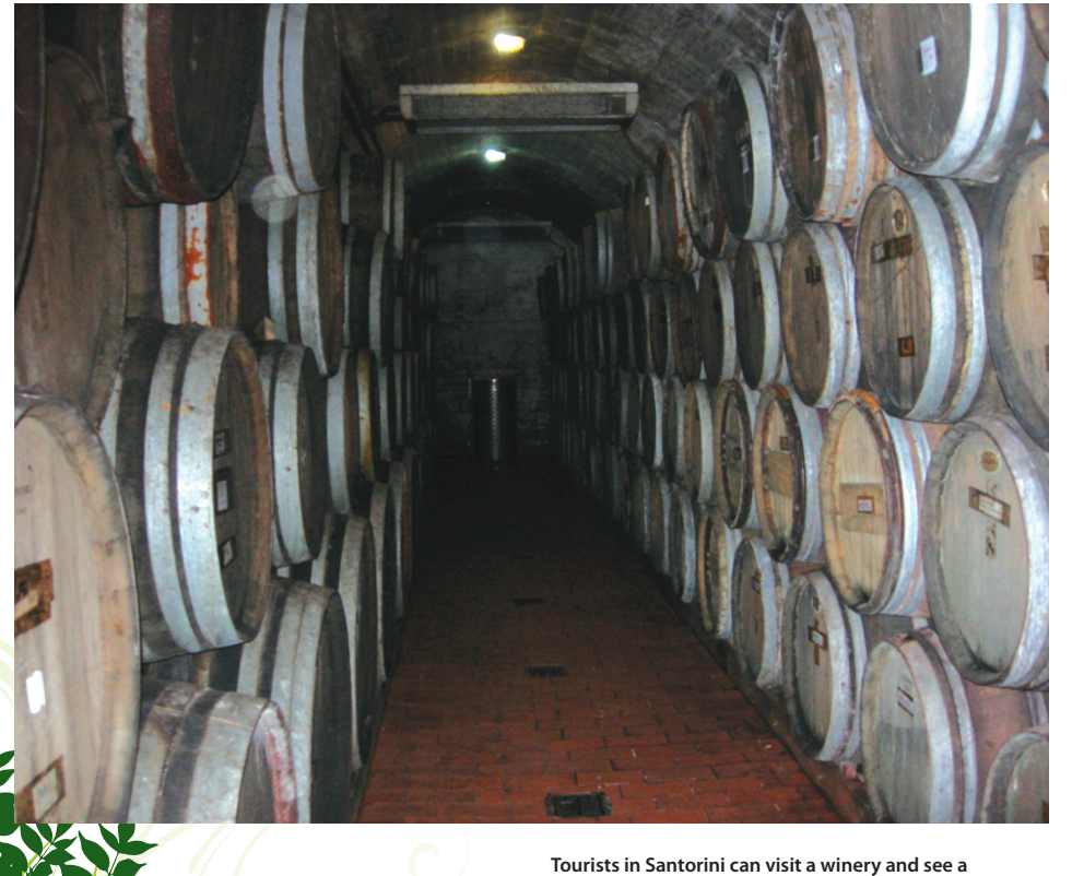
traditional 'kanava' (a cave dug in the volcanic soil, which is a wine cellar)

In Santorini, the phase of standardisation/ globalisation, and replacement of peasant-like farming systems by modernised intensive farms (which characterises the food system all over urbanised areas of Western Europe) did not really occur before the transition in those Islands: consequently, the niche has developed directly as an hybrid of both the niche and the regime shown in the two other case studies (standardisation and modernisation of the production process, local optimised processing, increase of local