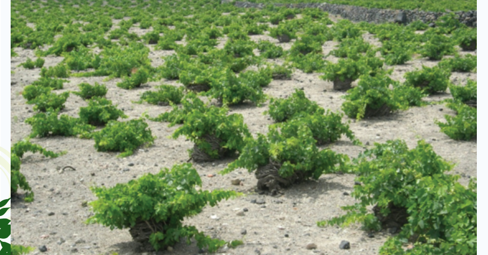
Traditional vineyard in Santorini